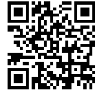
For complete information, please see www.safetyandhealthfoundation.org/maryjoy

Professional managed by Safety And Health Foundation