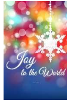
Joy To The World